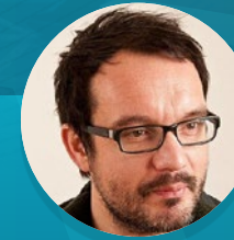
David McCandless Information is Beautiful