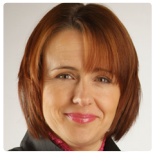
Tanni Grey-Thompson Paralympian, Crossbench Peer in the House of Lords & Broadcaster